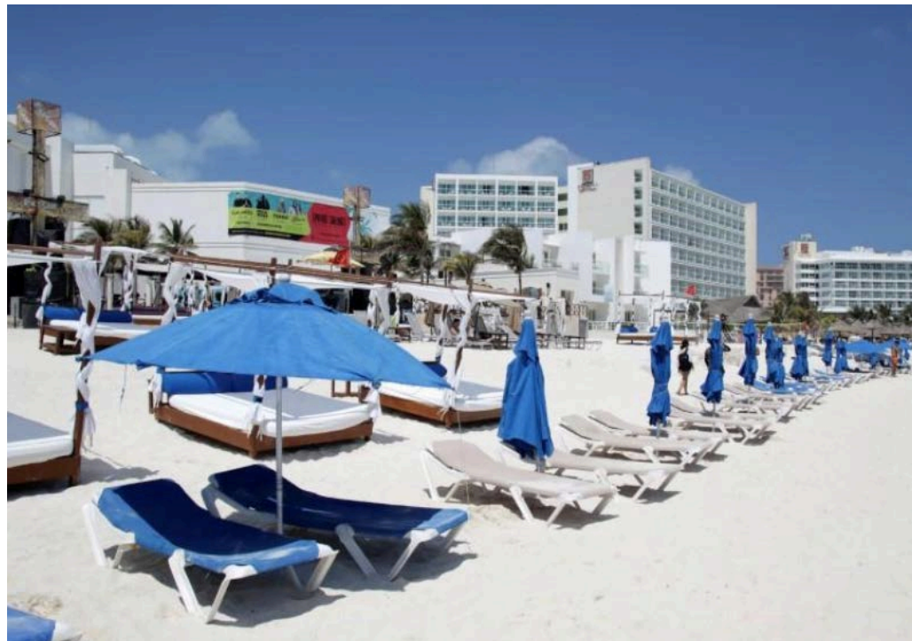
Cancun